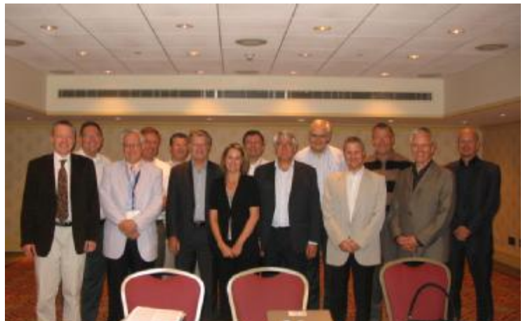
From the left (BA, AA, NH, KL, AF, LH, UA, IATA, ACL, ACA, COHOR, FHKD, SCS, SACN)

As this issue of Asian Breeze goes to print, I have had an opportunity to reflect on my career so far and realized I am a very fortunate individual. While the industry is facing unprecedented economic challenges, I am thankful not only to be employed, but employed in a position I thoroughly enjoy. Today's environment requires slot portfolio management be done via careful juggling of operational, commercial and regulatory considerations - making it far more complex and interesting than would appear to an outsider. I love my position at United, addressing industry issues with IATA and regulators through SPWG and JSAG and the important work we do for the broader industry. I especially admire my colleagues and enjoyed working with members of the airline, airport and coordinator community.