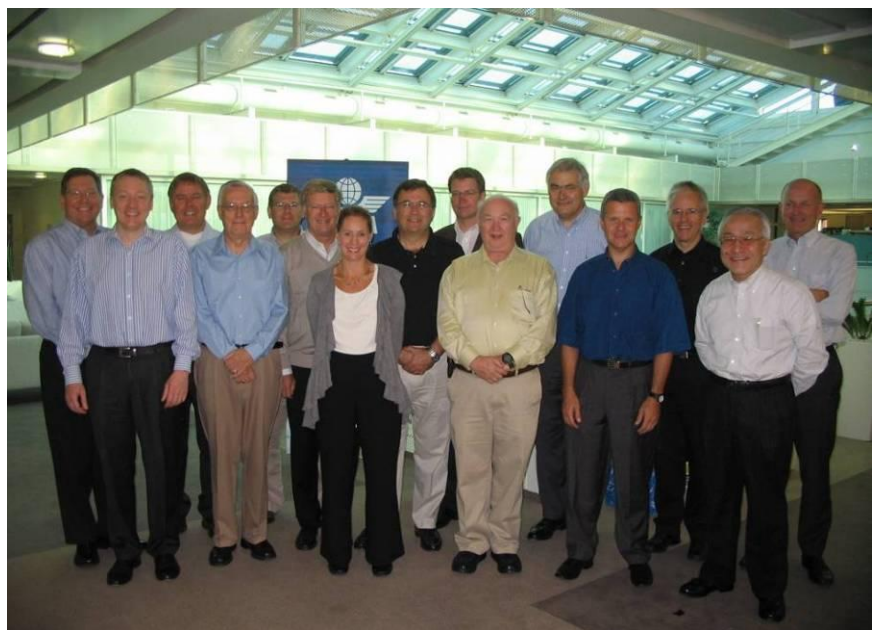
AA, BA, KL, NH, AF, LF, UA, IATA, ACL, ACCL, ACA, COHOR, SCS, NRT, SACN

Compared with the picture of old members shown in 5 th edition of Asian Breeze, you may find how drastically the members have changed. Actually there is no change for airline members, and three are 4 new members on coordinator side of JSAG.